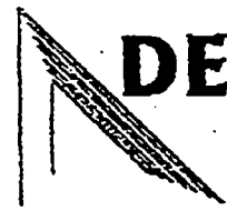
Exhibit "A" Page 1 of 2